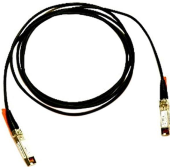
Figure 3. Cisco direct-attach twinax copper cable assembly with SFP+ connectors

Cisco SFP+ Copper Twinax (Figure 3) direct-attach cables are suitable for very short distances and offer a cost-effective way to connect within racks and across adjacent racks. Cisco offers passive Twinax cables in lengths of 1, 1.5, 2, 2.5, 3, 4 and 5 meters, and active Twinax cables in lengths of 7 and 10 meters.