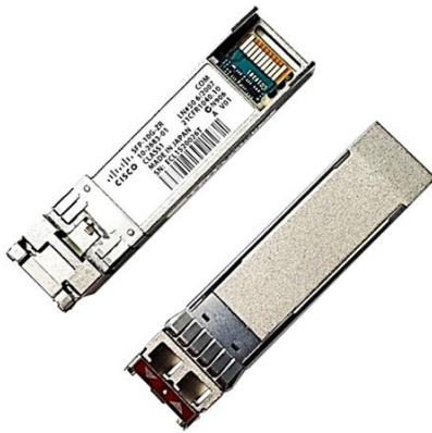
Figure 1. Cisco 10GBASE SFP+ Modules

The Cisco® S-Class 10GBASE SFP+ modules (Figure 1) offer customers a variety of 10 Gigabit Ethernet connectivity options optimized for Enterprise and data center applications. S-Class optics are available for the most common reaches needed for these applications.